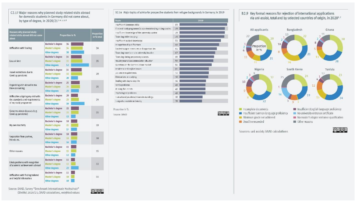
Figure 1 – "Major reasons why planned study-related visits abroad for domestic students in Germany did not come about, by type of degree, in 2020/21 [C2.17]" (Wissenschaft Weltoffen 2021)

alone around 5.6 million students were enrolled outside their home country. (DAAD and DZHW, 2021) And yet, the obstacles on a simply organisational level can be detrimental. Domestic students in Germany list 'difficulties aligning my visit with the standards and requirements of my study programme' as one of the major reasons for declining a planned study visit abroad (cf. Figure 1). In 2019, major topics of advice for prospective students from refugee backgrounds in Germany were the 'recognition of qualifications' and 'missing documents' (cf. Figure 2), while one of the main reasons for the rejection of international applicants from Bangladesh, Ghana, Nigeria, South Korea and Tunisia to a German university in 2020 were 'incomplete documents' (cf. Figure 3). These findings suggest that DCs could be an important instrument in overcoming formal hurdles for international exchange.