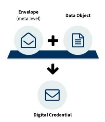
Figure 5 – Envelope and data object metaphor

form and the level of the content contained in the credential, as different issues need to be resolved at both levels. To describe this, the metaphor of the envelope and the data object it contains has become established, following the familiar processes of the physical world (Chartrand et al., 2020).